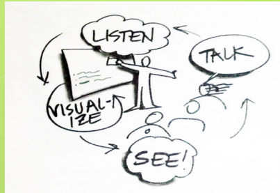
Step 1 - Conduct observations