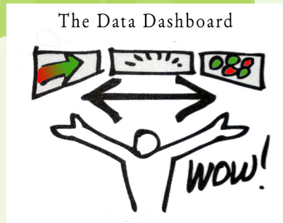
Step 3 - Design relevant professional development opportunities